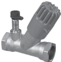
With PT Port